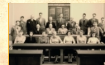
Staff of Newquay UDC C1960

Newquay Parish Council finally came into being with 20 members in 1985 and Cllr. Norman Thompson became its first Chairman. The new council, although inexperienced, was immediately accepted and with hard work and dedication, soon became an important part of Newquay life. Within