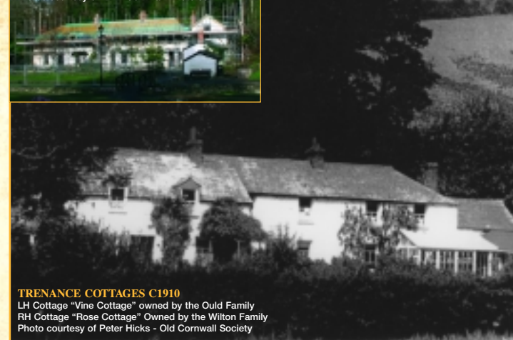
TRENANCE COTTAGES C1910 LH Cottage "Vine Cottage" owned by the Ould Family RH Cottage "Rose Cottage" Owned by the Wilton Family