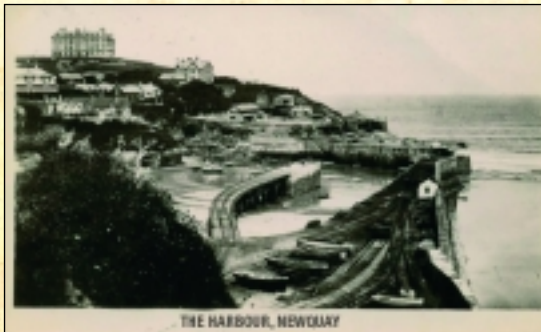
THE HARBOUR, NEWQUAY