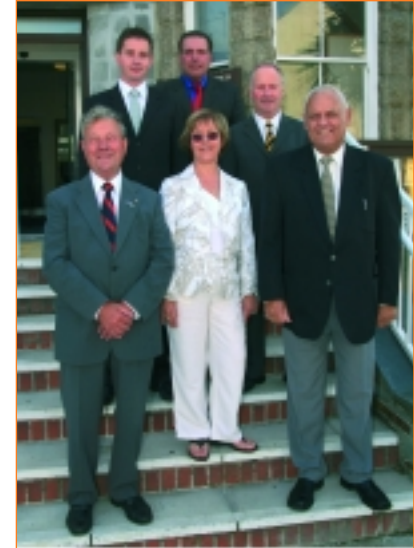
The Quality Council Status working party

In order to keep this report concise, we can report that all the other criteria is being addressed. Finally, and importantly, Councillor's on our working party, as well as many other Councillors are attending various training sessions, conferences and significantly, all of the ONE CORNWALL executive committee meetings. Our aim is to be up to the minute with all developments and bring back insight and knowledge which will help to formulate the best way forward in readiness for the major changes that the new Unitary Authority will bring about. There has never, I imagine, been a better time for Newquay Town Council to attempt earning the title of "Quality Council Status".