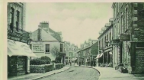
BANK STREET, NEWQUAY